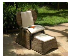
NORMANDIE Natural Rattan in Cozy Style, with Foot Rest.