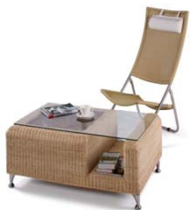
COMFORT Chair ATLAS Table Synthetic Rattan, in Easy Relax Folding Chair, and Artistic Teakwood Carved Top Table