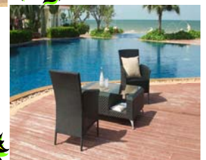
PHOENIX Synthetic Rattan, with patented Bendable Backrest.